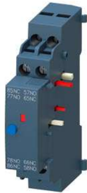
signaling switch for circuit breaker 3RV2 with screw terminal